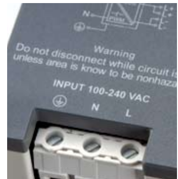
Wide input range

The 24 V units of the CP-E range, offer a transistor output for monitoring and remote diagnosis.